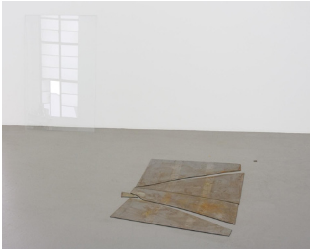
Alicja Kwade, condition 1+2 , 2009

Sleight of hand is a set of techniques used to manipulate objects and covertly misdirect an audience. It is based on an idea of spectator failure and the suspension of disbelief necessary to convince oneself that the illusion is magical. The art works and curatorial framework of Disappearing Into One question whether we can understand art as operating through this same process: as an inversion, a transformation or even a physical anomaly. In the end, is it possible that a flourish of the hand can enable meaning and production at the point of encounter?